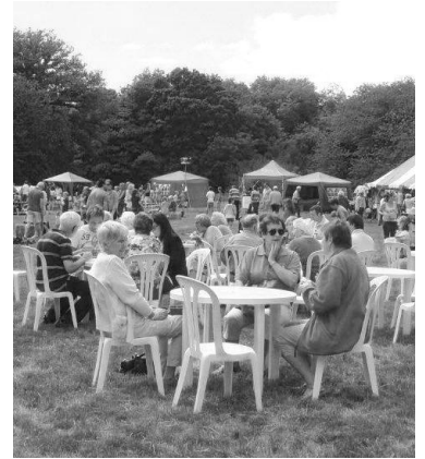
Taking a Break