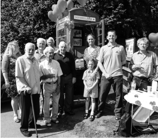
Telephone Box Defibrillator Inauguration