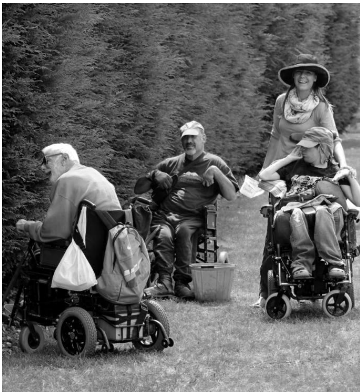
A support worker helping her students