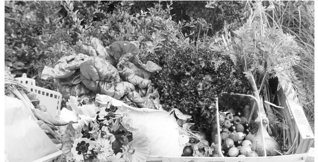
Produce from Greenshoots

Greenshoots also has a thriving flock of egg-laying chickens, which, when they concentrate, may lay collectively up to 20 eggs a day, which we