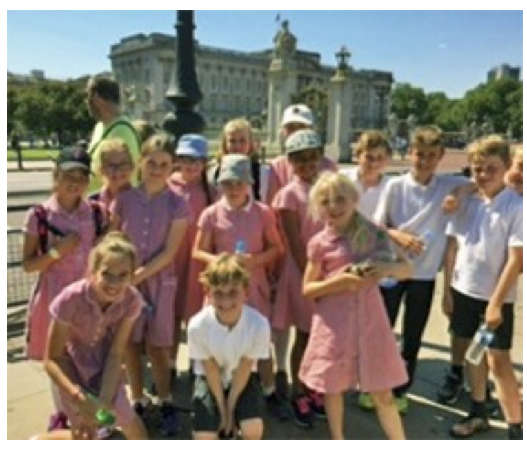
Peppard schoolchildren enjoying Buckingham Palace