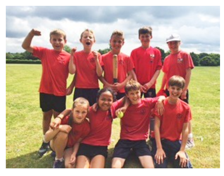
The winning Rounders team