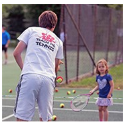
Another tennis star in the making

www.teachmetennis.co.uk or feel free to give us a call on: 01491 728080