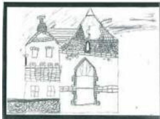
Sketch of School