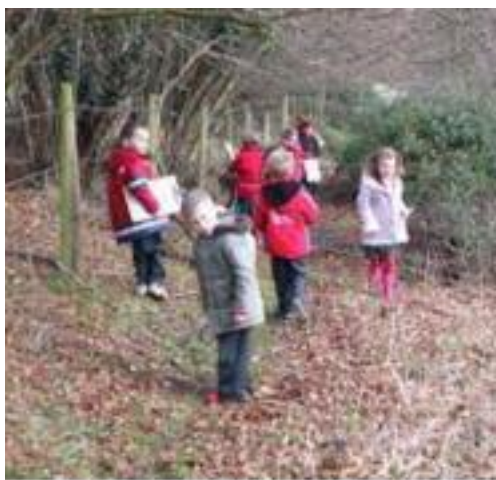
Mini Beast Hunt

The children learnt all about the scientific forces. Greys Class went on a mini-beast hunt and had lots of fun finding creepy crawlies.