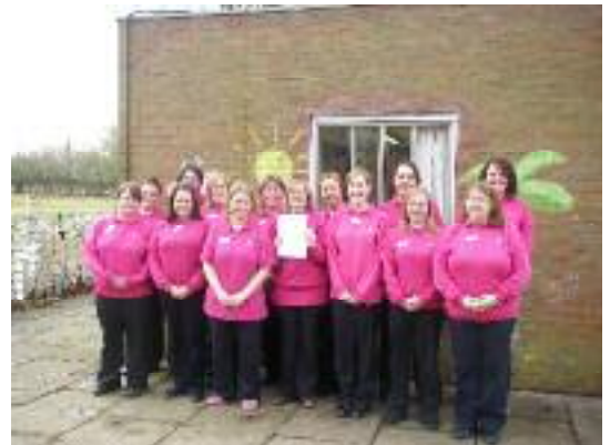
Staff of Bishopswood Day Nursery proudly displaying their Ofsted certificate

Congratulations to the nursery on their very positive Ofsted Inspection Report. To see the report in its entirety see www.PeppardNews.co.uk or www.bishopswoodnursery.co.uk