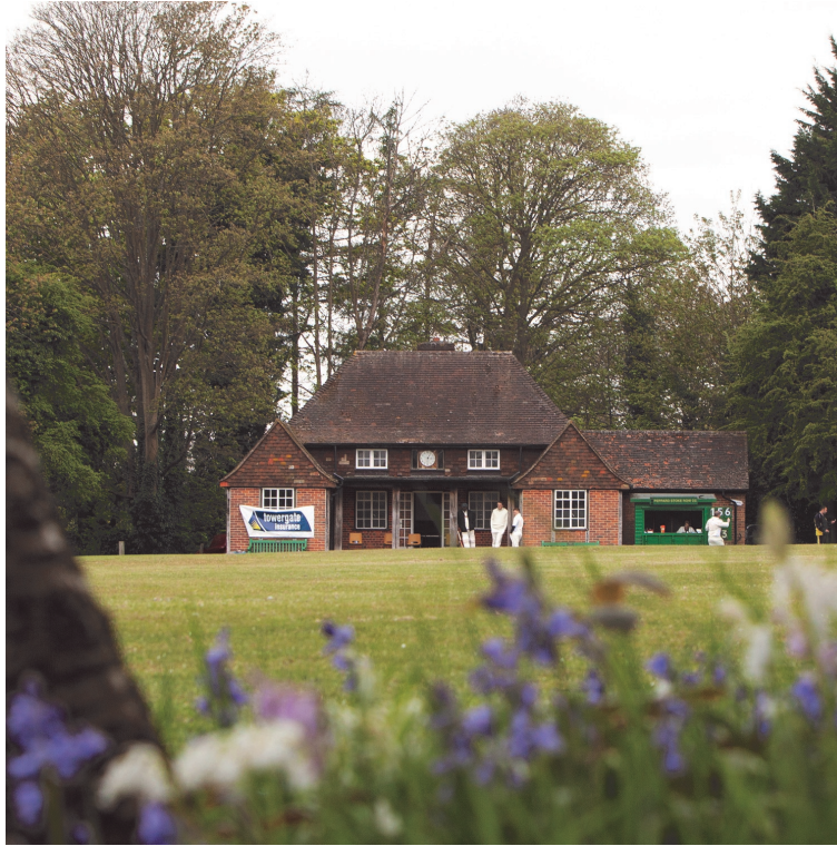
Peppard Sports Pavilion