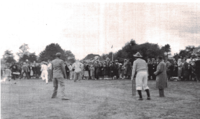
Fancy Dress Cricket circa 1953