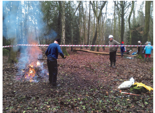
Members of the Green Gym in action

If, like me, you enjoy watching Trust Me, I'm A Doctor on TV you may have seen the report that highlighted that, from the 40s onwards, we start losing our muscle