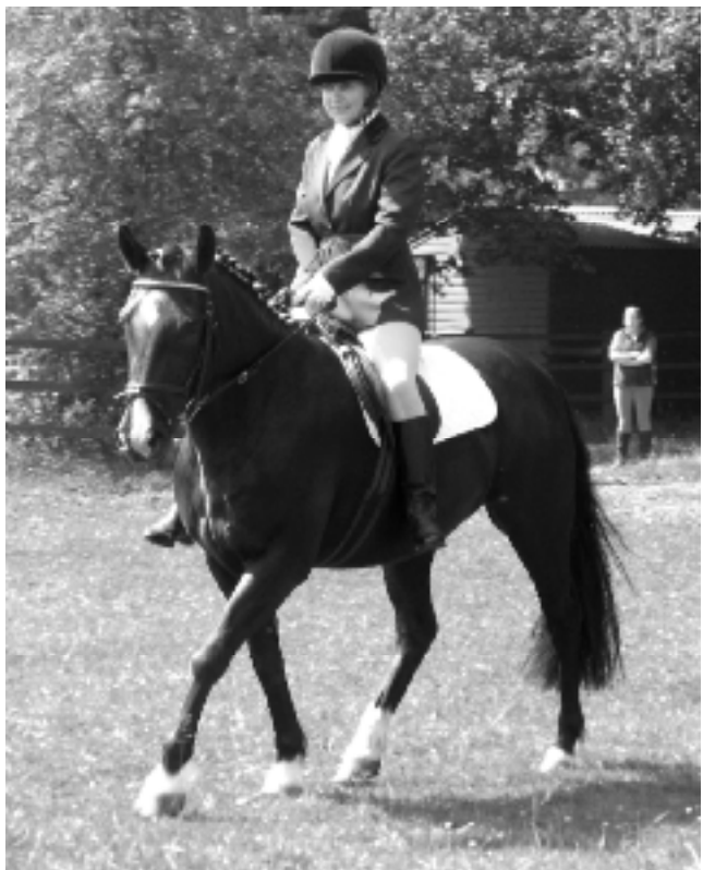
Benjy in his heyday