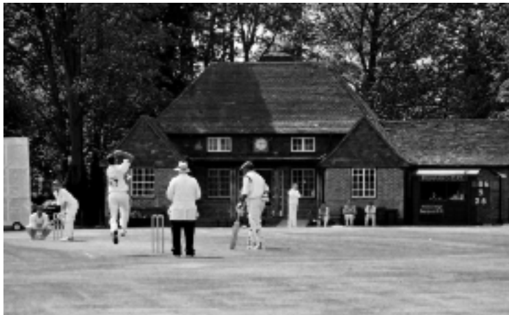
Sunday afternoon in Peppard

respondents were concerned about traffic but 75% did not think traffic noise was unacceptable; and only 5% would support a reduction in speed limit across the commons.