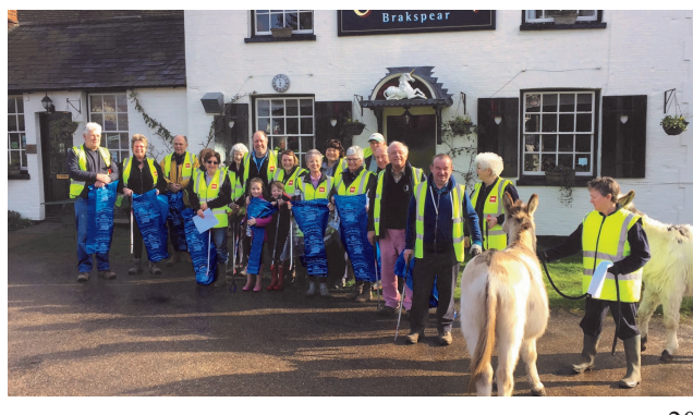
The litter picking group plus two donkeys

I am a man of few words so this article will be a lot less than all the rubbish an intrepid group of Peppard parishioners picked up on the annual 'clean up' of the village.