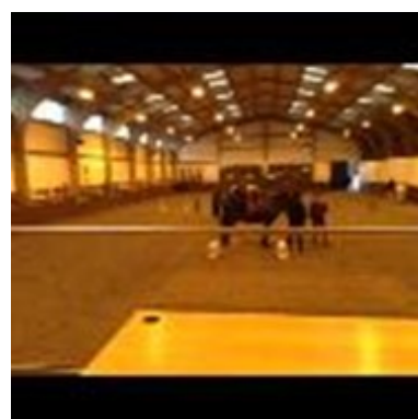
Viewing area—Diamond Centre