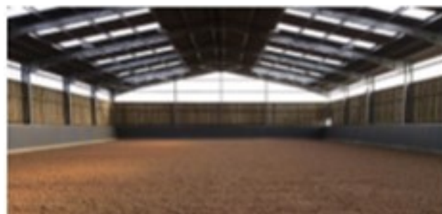
Possible design for illustrative purposes

On the morning of 13 January we will be welcoming local councillors to the yard for a preview of the consultation before the formal opening in the afternoon.