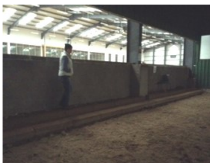
Two school connection

A display will be set up in the Coffee Room. There will be a feedback form for you to complete either as a hard copy or on-line at Survey Monkey . You can also feedback via your Session Leader