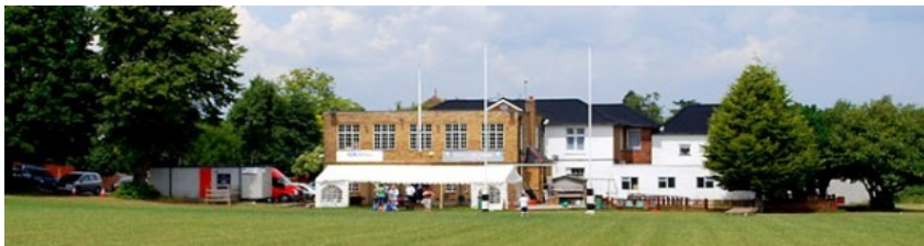
Sutton and Epsom Rugby Club

Tickets priced at £15 to include a barbecue and music from a live band The Kingsfolk