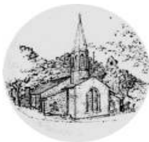
St. George Brockholes