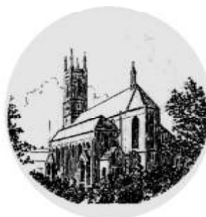
St. Mary the Virgin Honley