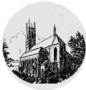
St. Mary the Virgin Honley