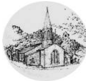
St. George Brockholes