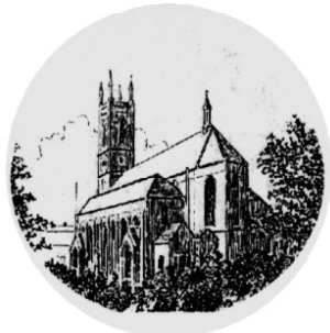
St. Mary the Virgin Honley