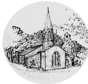
St. George Brockholes