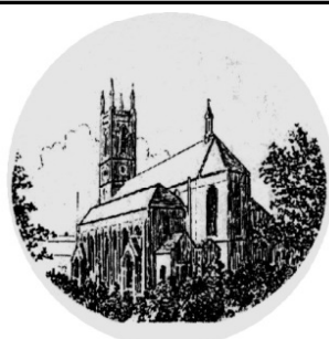
St. Mary the Virgin Honley