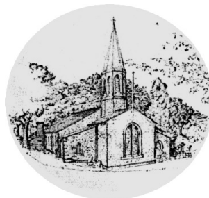
St. George Brockholes