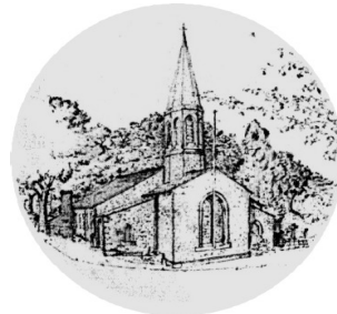
St. George Brockholes