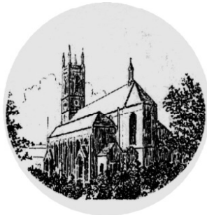
St. Mary the Virgin Honley