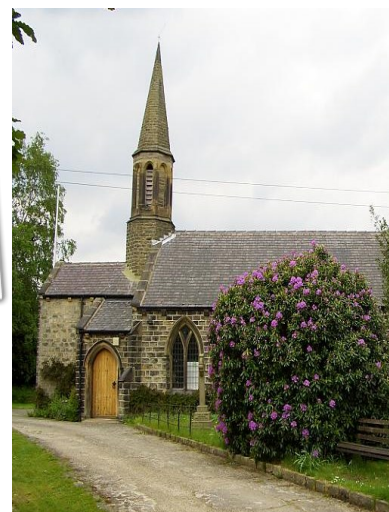
St. George's Brockholes