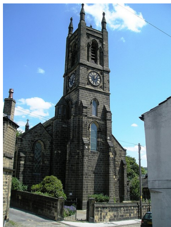
St. Mary the Virgin Honley