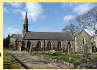
St George's Brockholes