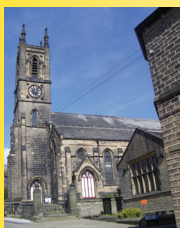
St Mary's Honley