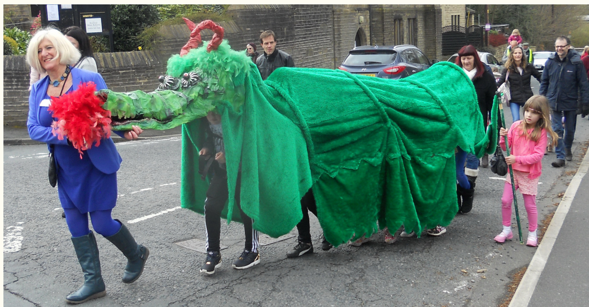
Parading the Dragon through Brockholes on St George's Day after the service in St George's Church and before the food and fun in the churchyard