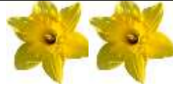
TABLE TOP SALE