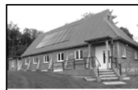
Peasmarsh Memorial Hall Management Committee