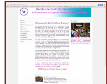
CRFS Website Homepage

The purpose of this user guide is to encourage you and other CRFS Members and Friends to visit the website and to help you make best use of it. It assumes little or no experience of websites on the internet so starts with some of the basics.