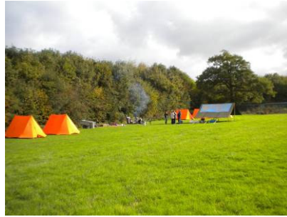
a really great pitch