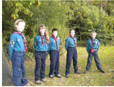
flag down for the end of a really back