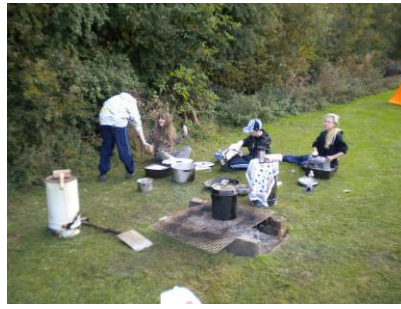
and they then had to clean the Dixies