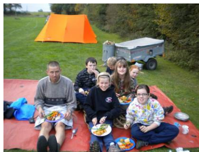
scouts made a really tasty meal and