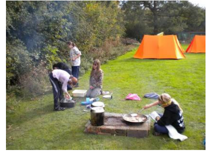
cooking on open fires all weekend