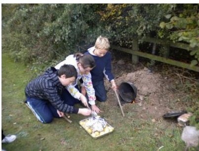
Roast Pork for Saturday dinner the