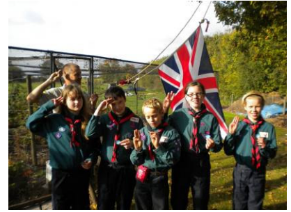
to basics camp and a lot of new experiences for the Scouts