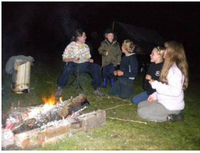
camp fire and spontaneous songs