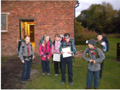
Preparing to walk to camp

the leaders were fed well, a really good show by the Scouts