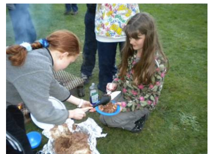
chocolate steamed sponge pud