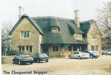
The Chequered Skipper