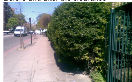
Before and after the clearance

The Regent's Park Warden noticed hedges were encroaching on the public highway along Lisson Grove and St John's Wood Road. By liaising with the letting agent, the hedges were tidied within two weeks and the highway is now much clearer for residents.