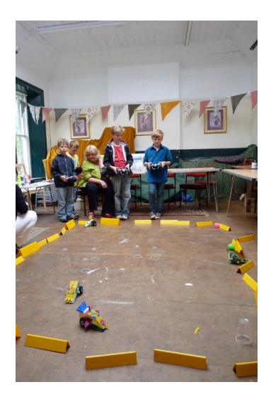
having fun in the Billiard Hall putting them to good use