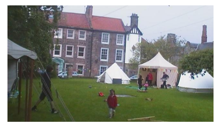
Family Fun Fest day - What a shame it rained everyone still enjoyed themselves