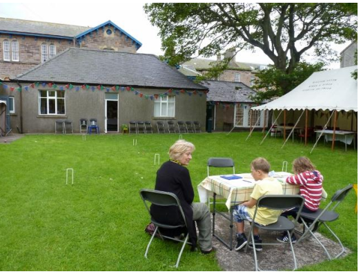
Children's competition "Picture of the Pavilion"