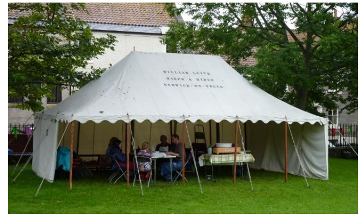
Pottery workshop undercover of the Marquee in the rain

Can the Palace Green Pavilion Trust say a huge thank you to everyone that took part, helped out, made cakes or even just came along to enjoy the event you helped us raise £1,279