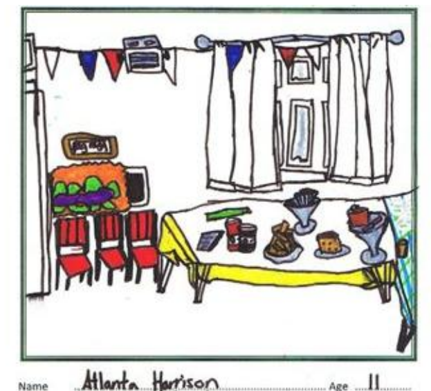
Mayor's Prize - Overall winner

The two age group categories were 4 - 8 and 9 -14 years old